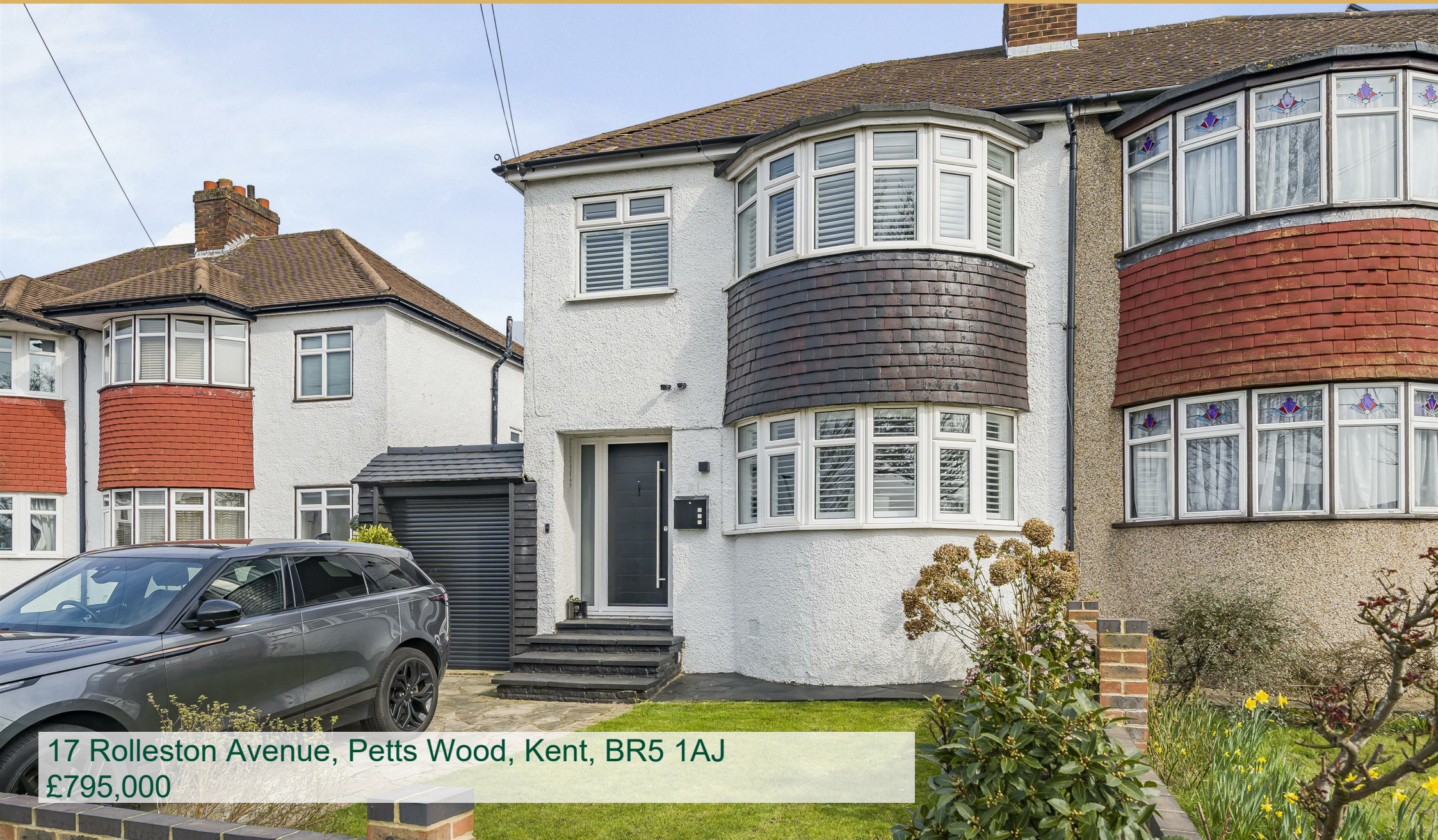
17 Rolleston Avenue, Petts Wood, Kent, BR5 1AJ £795,000